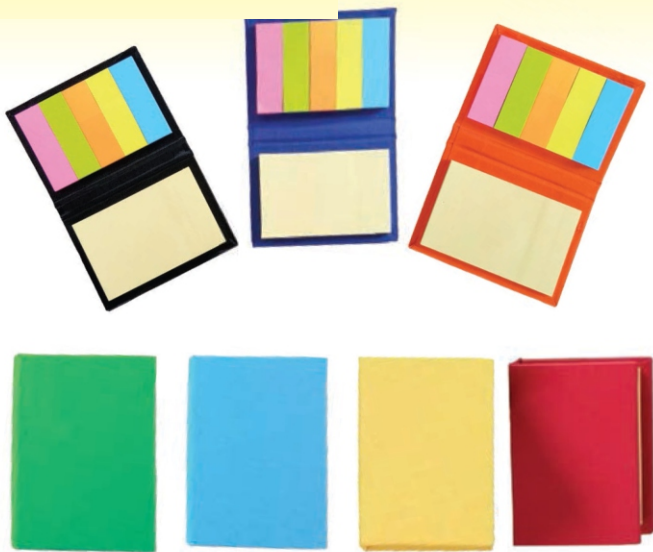
Eco-Friendly Sticky Note-pad Holder Product Code M046-C