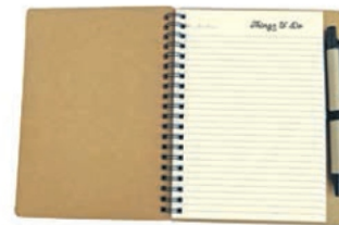
Product Code M061