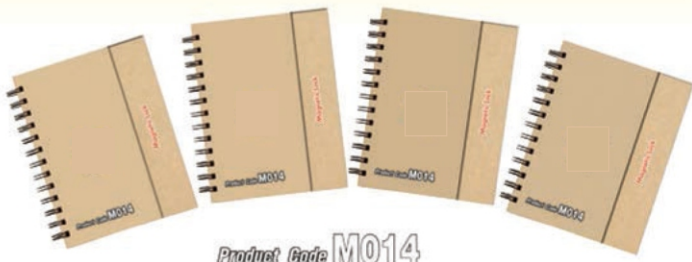
Product Code M014