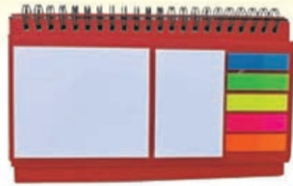
Product Code M058