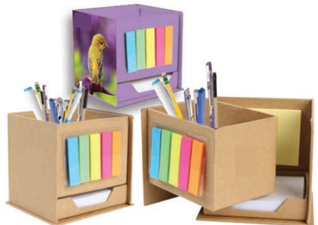
Eco-Friendly Personal With Sticky Note (Square) Product Code M08