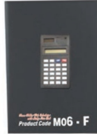
Foam Folder With Calculator and Sticky Note Pad Product Code M06 - F