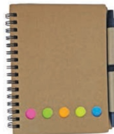
Product Code M053