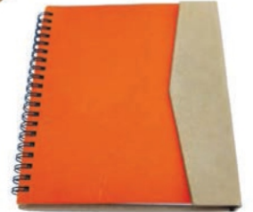
Product Code M059