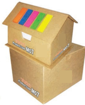
Eco-Friendly House Cube With Sticky Note Pad Product Code M07