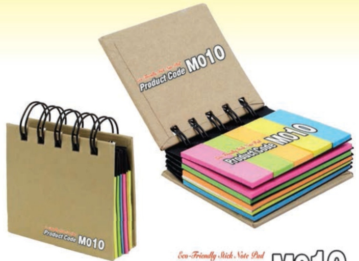
Eco-Friendly Sticky Note Pad Product Code M010