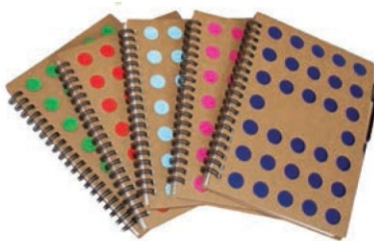
Product Code M052