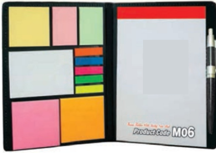
Foam Folder With Sticky Note Pad Product Code M06