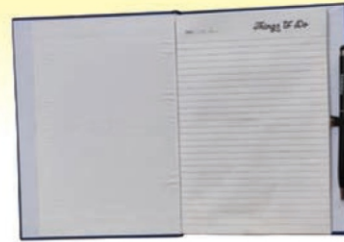
Product Code M051