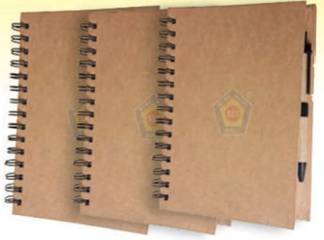
Eco-Friendly Wire Dairy With Sticky Writing Note Pad Product Code M032