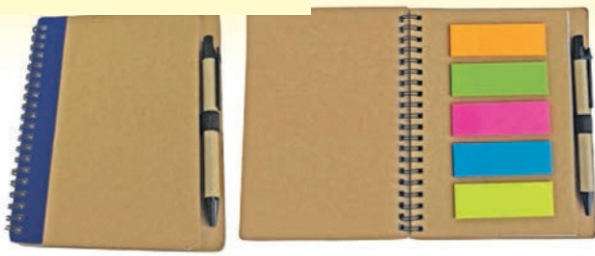
Product Code M050