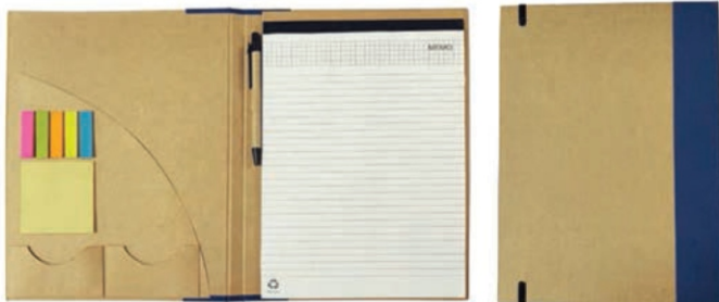
Product Code M057