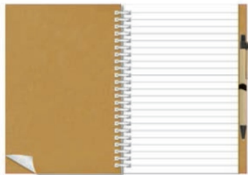
Product Code M054