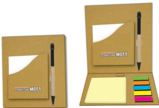
Eco-Friendly Sticky Note Pad Product Code M011