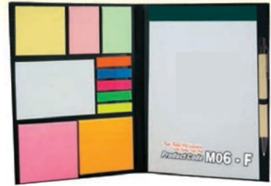
Foam Folder With Calculator and Sticky Note Pad Product Code M06 - F