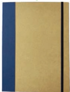
Product Code M056