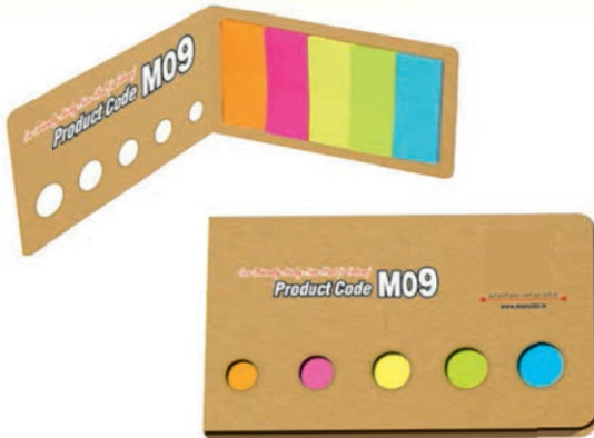
Eco-Friendly Sticky Note Pad (6 Colors) Product Code M09