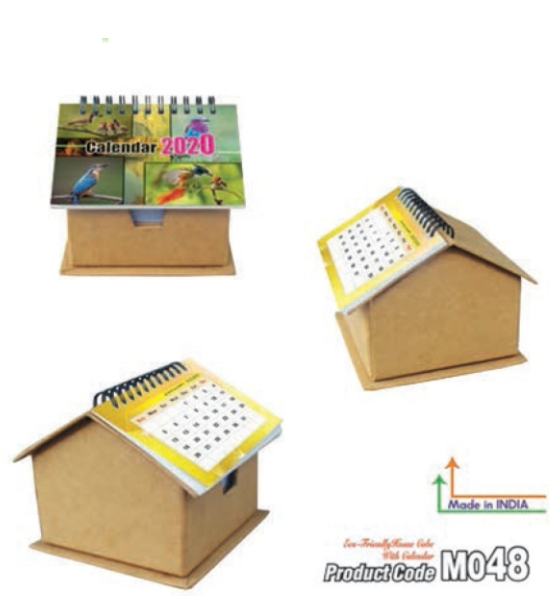
Eco-Friendly House Style With Calendar Product Code M048