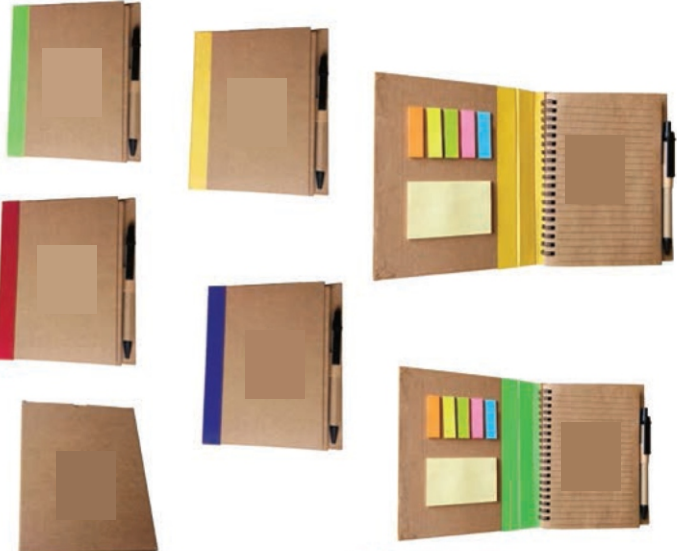
Eco-Friendly Writing pad with Sticky Note Pad Product Code M033