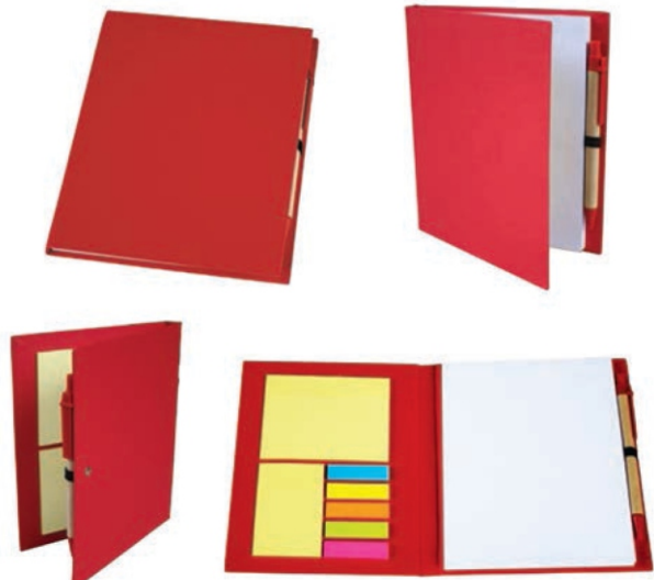
Eco-Friendly Sticky Note Pad With Pen Product Code M049

WE MAKE PERSONALISED Sticky NOTE PAD FOR YOUR BUSINESS