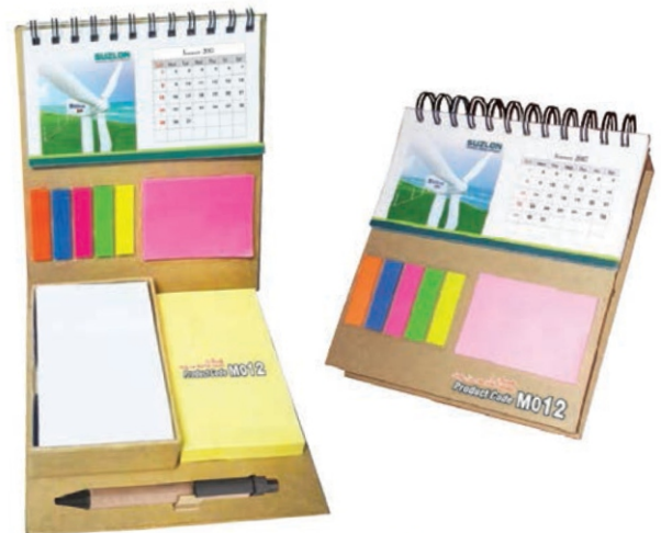
Eco-Friendly Sticky Note Pad With Calendar Product Code M012