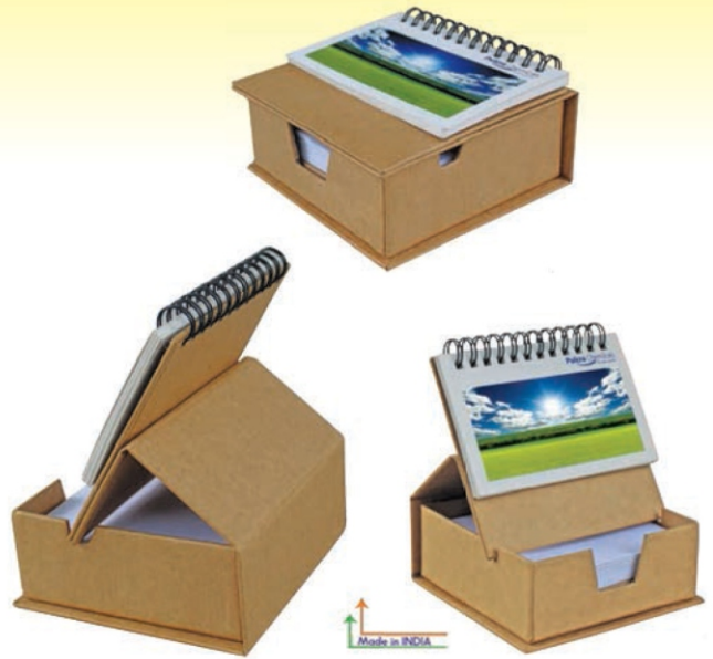
Eco-Friendly Box With Writing Note Pad & Calendar Product Code M047